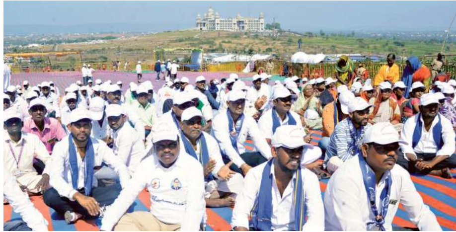
Members of Madiga Samaja Okkoota staging a protest near Suvarna Soudha in Belagavi on Wednesday.

Three groups meet Ministers to submit memoranda, while the others put forward various demands