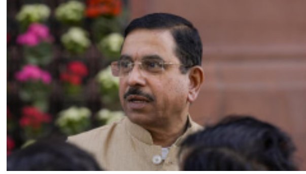
EMS News Agency, March

Union Minister for Parliamentary Affairs Pralhad Joshi lashed out at the Congress, saying the party had no moral right to speak about corruption. He was reacting to the Congress party's demand for Chief Minister Basavaraj Bommai's resignation over the arrest of BJP MLA Madal Virupakshappa's son by the Lokayukta. "The Congress has no moral right to speak about corruption.