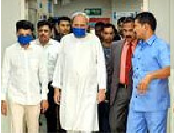
EMS News Agency, March

Odisha Chief Minister Naveen Patnaik on March 5 announced the establishment of a health university in the State on the occasion of the 107th birth anniversary of legendary politician Biju Patnaik. All the medical and allied health science colleges and institutions will stand