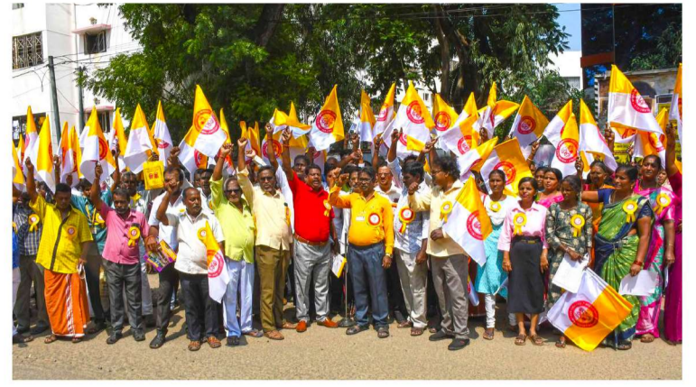
▶ Tamil Nadu Thaiyil Thozhilalar Sangam staged a protest near the Collectorate in Tiruchi