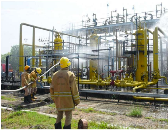
▶ ONGC on Monday conducting a mock drill at Nallore hamlet near Kovilkalappal.