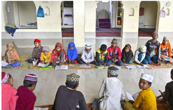
▶ Students at a madrasa in Azad Nagar dera village of Uttar Pradesh's Unnao District.